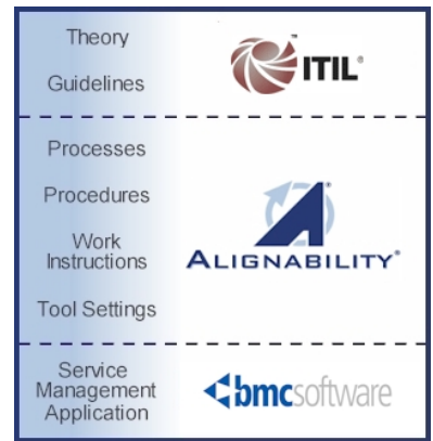
Bridging the gap between ITIL and BMC Service Desk Express Suite

BMC Alignability for Service Desk Express provides practical, detailed, and specific instructions on how service providers deliver and support their services. By ensuring that these processes are supported by BMC Service Desk Express Suite, it bridges the gap between ITIL theory and a supporting service management application.